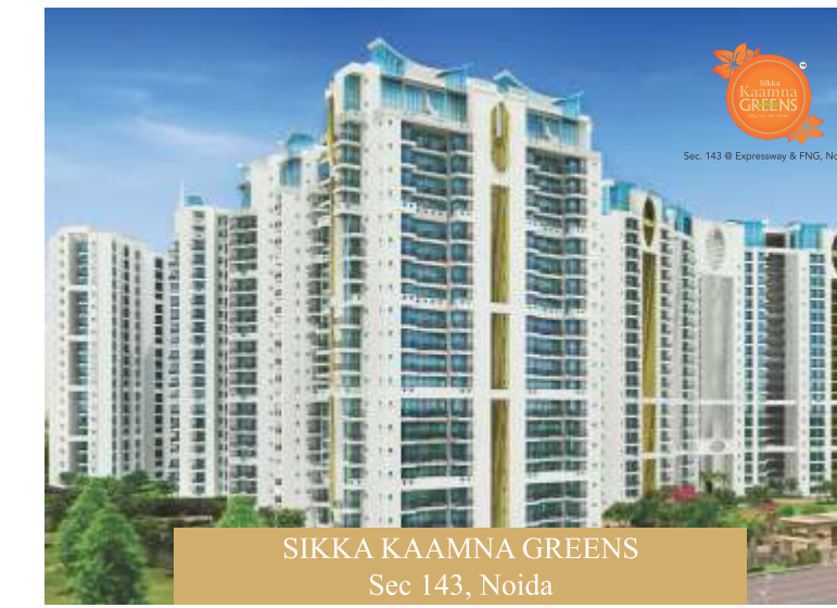
SIKKA KAAMNA GREENS Sec 143, Noida