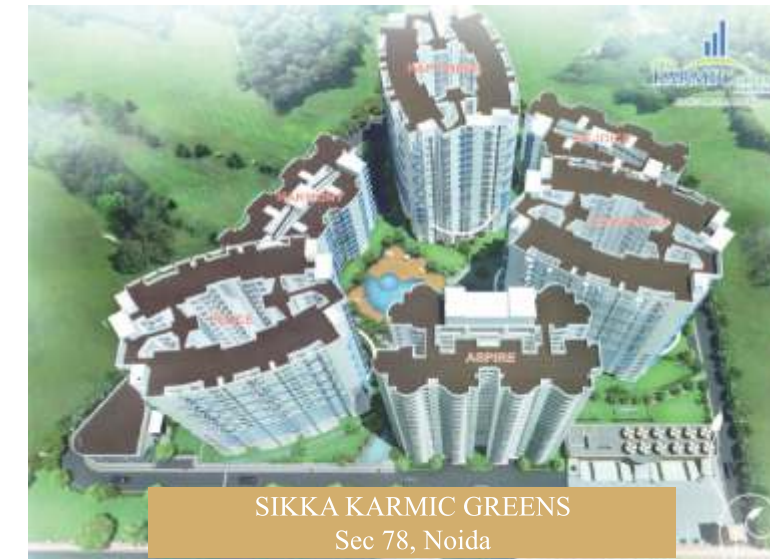
SIKKA KARMIC GREENS Sec 78, Noida

presence in the real estate, Sikka is a distinguished business entity in the industry of automobiles, posting an impressive turnover of INR 5 billion. In the hospitality sector the conglomerate is in the process of developing & operating 5 star hotels, service apartments, business & boutique hotels under its wings. This time around we wanted to push the envelope further. We wanted to challenge ourselves, exceed all expectations and usher the New Age India. The Proud India. Now, living up to the expectations, Sikka is presenting Sikka Kimaya Greens, a high-end premium residential group housing project at Sahastradhara Road, Dehradun.