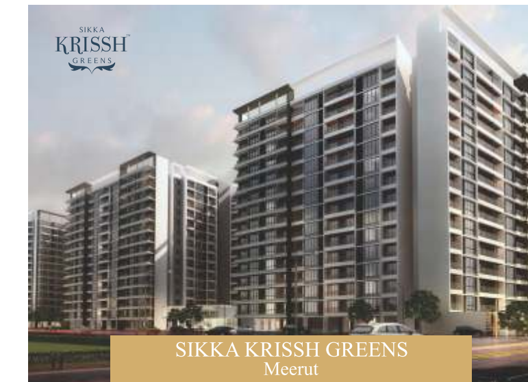
SIKKA KRISSH GREENS Meerut