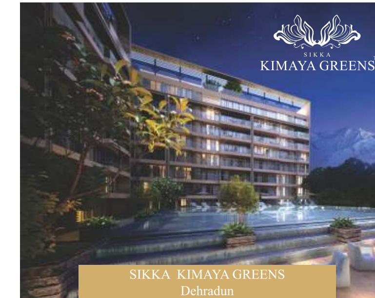
SIKKA KIMAYA GREENS Dehradun