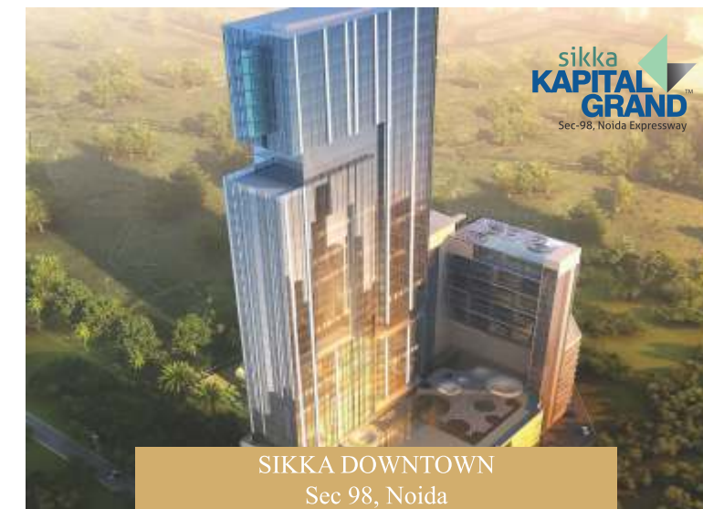
SIKKA DOWNTOWN Sec 98, Noida