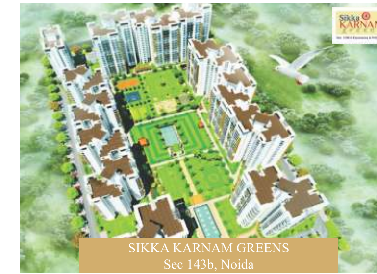
SIKKA KARNAM GREENS Sec 143b, Noida