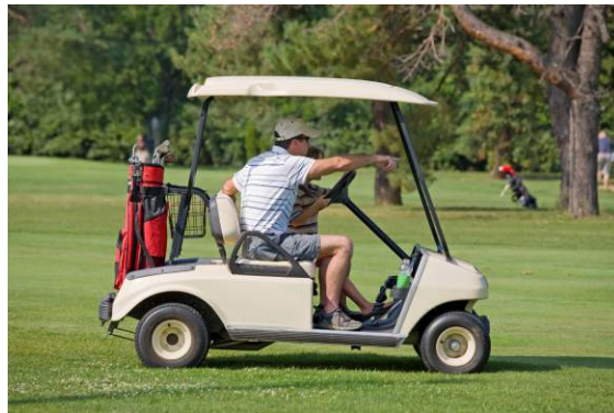
Golf Cart Service