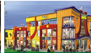
IPEX MALL, Patparganj, Delhi