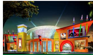
ANGEL MEGA MALL, Kaushambi