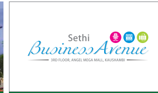
ANGEL MEGA MALL, Kaushambi