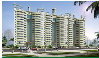
MAX CITY, Vaishali