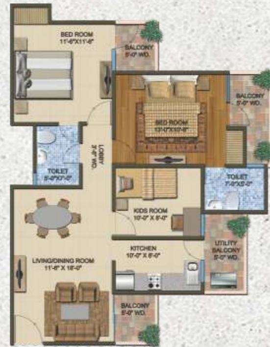
2 BHK + 2 TOILET + KIDS ROOM SUPER AREA = 1260 SQ. FT.