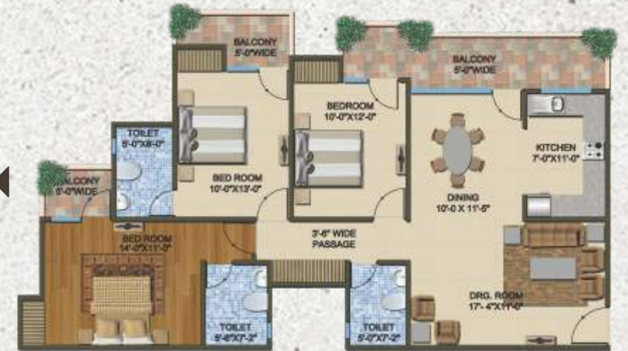
3 BHK + 3 TOILET + DIN. SUPER AREA = 1705 SQ. FT.