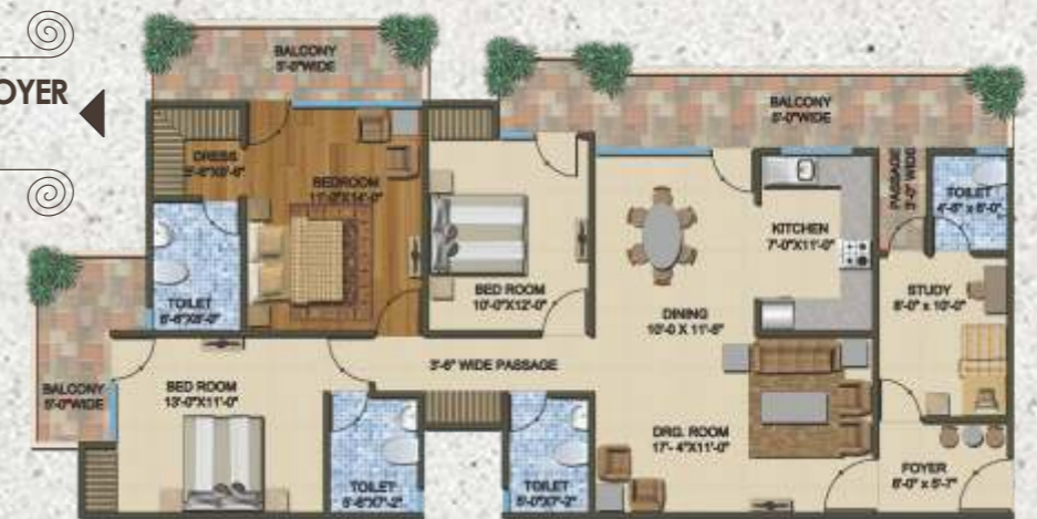
3 BHK + STUDY + DIN. + 4 TOILET + FOYER SUPER AREA = 2170 SQ. FT.