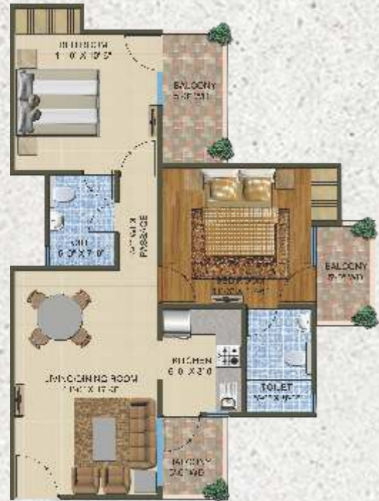
2 BHK + 2 TOILET SUPER AREA = 1020 SQ. FT.