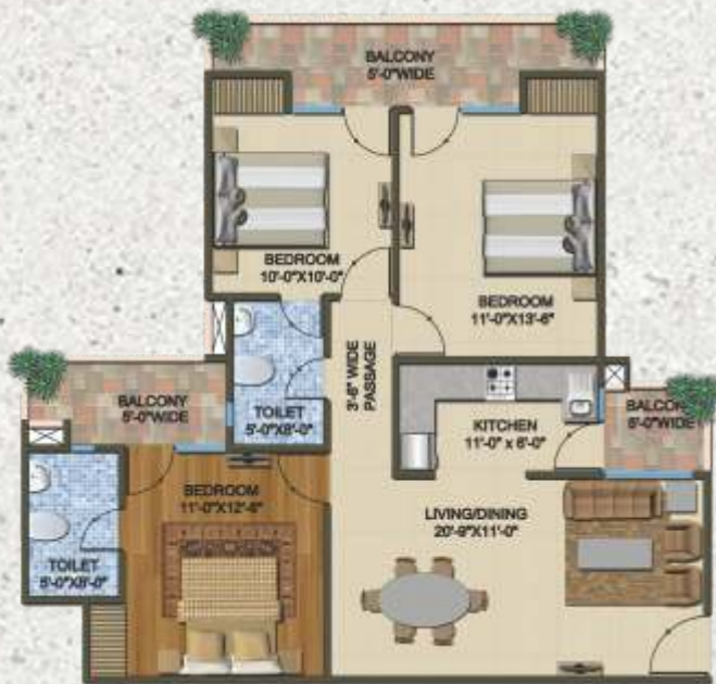
3 BHK + 2 TOILET SUPER AREA = 1425 SQ. FT.