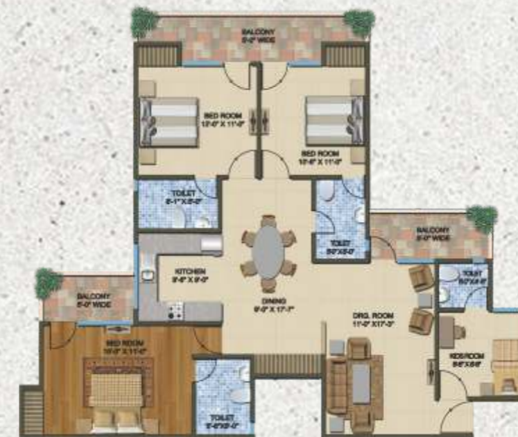
3 BHK + KIDS ROOM + DIN. + 4 TOILET SUPER AREA = 1900 SQ. FT.