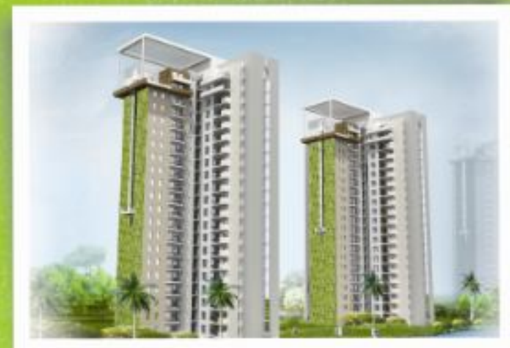
LOTUS PANACHE, NOIDA