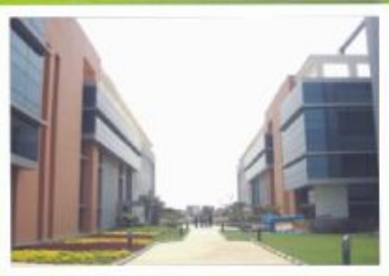
WIPRO TECHNOLOGIES, GREATER NOIDA GOLD RATED LEED CERTIFIED GREEN BUILDING - 2009