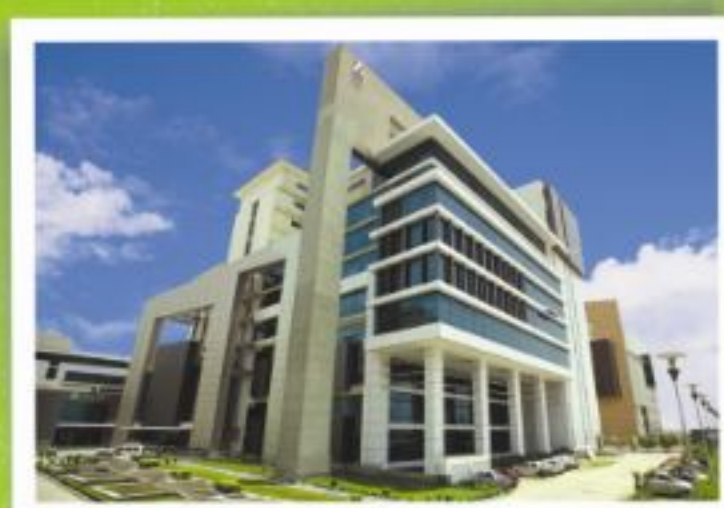
TECH BOULEVARD, NOIDA