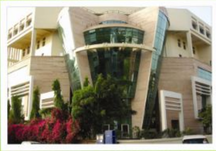
WIPRO TECHNOLOGIES, GURGAON PLATINUM RATED LEED CERTIFIED GREEN BUILDING - 2005