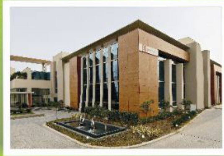
PATNI KNOWLEDGE CENTRE, NOIDA (BLOCK A) PLATINUM RATED LEED CERTIFIED GREEN BUILDING - 2008