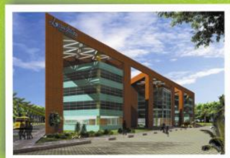
LOTUS VALLEY INTERNATIONAL SCHOOL, GURGAON

Note: Buildings get LEED rating only after they are operational.