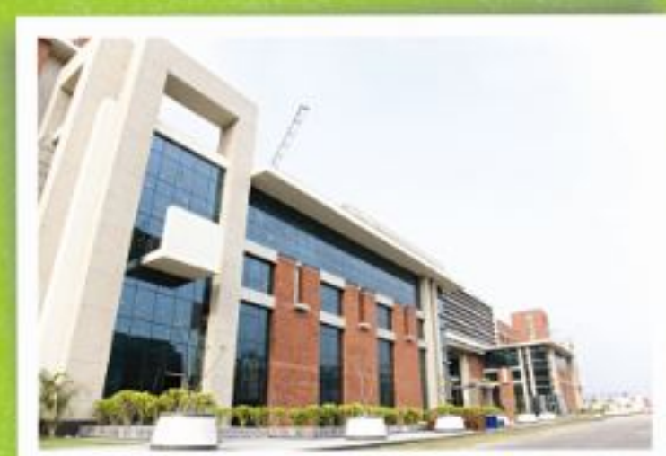
CSC CAMPUS, NOIDA