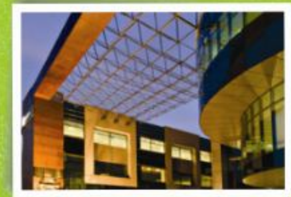
PATNI KNOWLEDGE CENTER, NOIDA (BLOCK B) GOLD RATED LEED CERTIFIED GREEN BUILDING - 2011