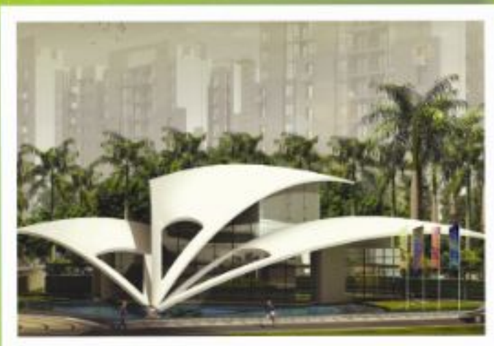
LOTUS BOULEVARD, NOIDA