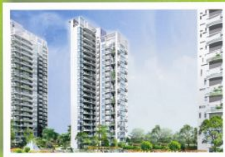
LOTUS BOULEVARD ESPACIA, NOIDA