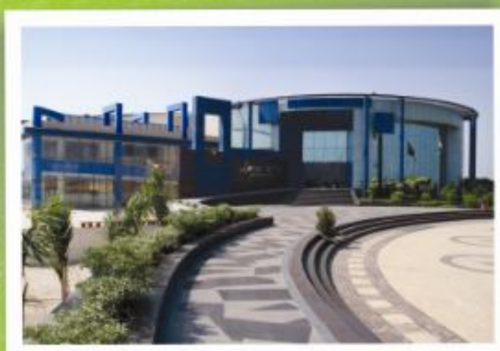
LOTUS VALLEY INTERNATIONAL SCHOOL, NOIDA