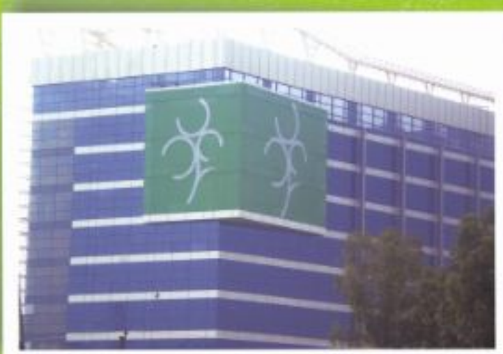
KNOWLEDGE BOULEVARD, NOIDA