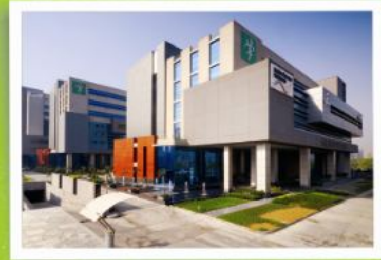
GREEN BOULEVARD, NOIDA PLATINUM RATED LEED CERTIFIED GREEN BUILDING - 2009