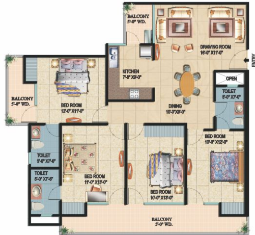
Super Area= 1750 Sq. Ft. 4-Bed Rooms + 3 Toilets + Drawing / Dinning + Kitchen + Balconies + Utility