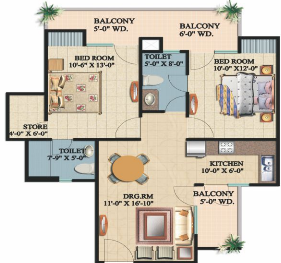
Super Area= 1080 Sq. Ft. 2 Bedrooms + 2 Toilets + Drawing/Dining + Kitchen + Store + Balconies + Utility