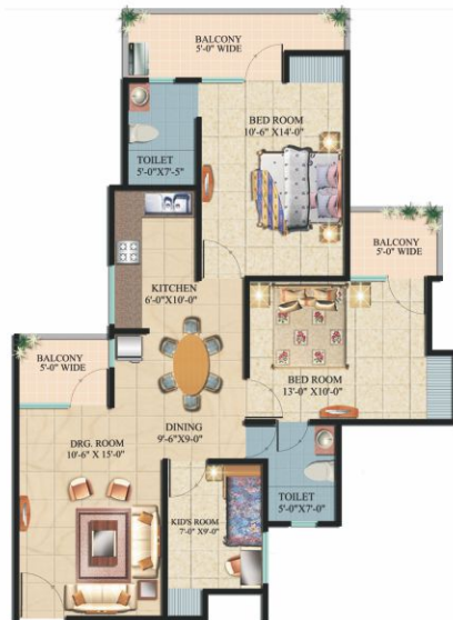
Super Area= 1265 Sq. Ft. 2 Bed Rooms + 2 Toilets + Kid's Room + Drawing / Dining + Kitchen + Balconies + Utility