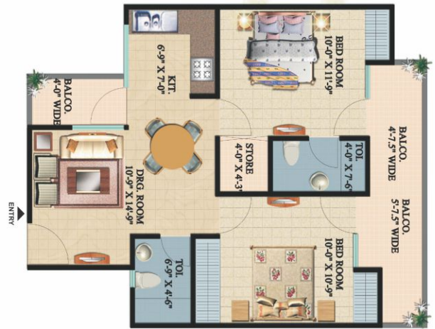
Super Area= 915 Sq. Ft. 2 Bed Rooms + 2 Toilets + Drawing / Dining + Store + Kitchen + Balconies + Utility