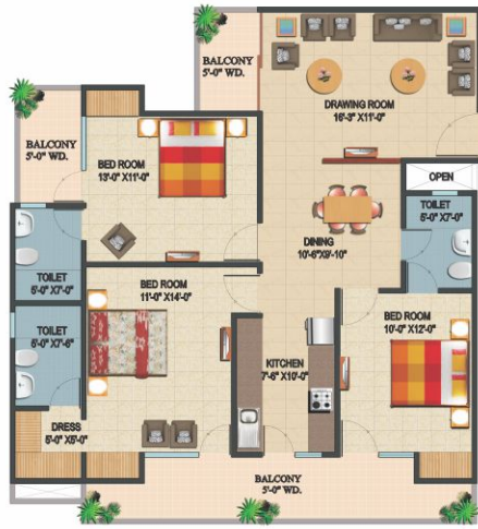
Super Area – 1625 Sq. Ft. 3 Bedroom+3 Toilets +Drawing/Dinning + Kitchen + Dress + Balconies.