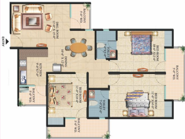
Super Area= 1450 Sq. Ft. 3 Bed Rooms + 2 Toilets + Drawing / Dining + Kitchen + Balconies + Utility