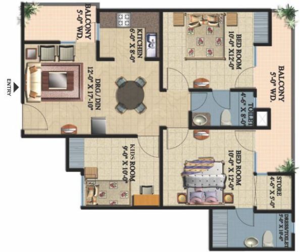
Super Area= 1175 Sq. Ft. 2 Bed Rooms + Kids + 2 Toilets + Drawing / Dining + Kitchen + Store + Balconies + Utility