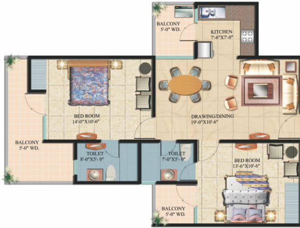
Super Area= 1095 Sq. Ft. 2 Bed Rooms + 2 Toilets + Drawing / Dining + Kitchen + Balconies + Utility