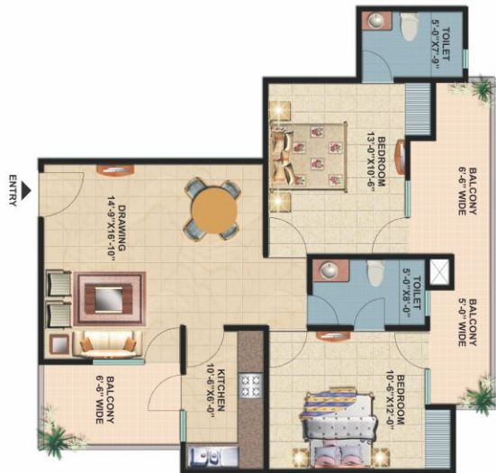
Super Area= 1180 Sq. Ft. 2 Bedrooms + 2 Toilets + Drawing/Dining + Kitchen + Balconies + Utility