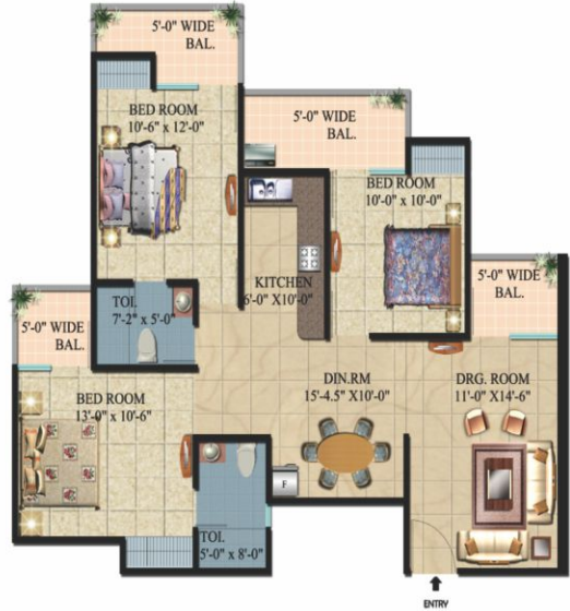
Super Area= 1370 Sq. Ft. (Tower K) 3 Bedrooms+2 Toilets+Drawing/Dining+Kitchen+Balconies+Utility