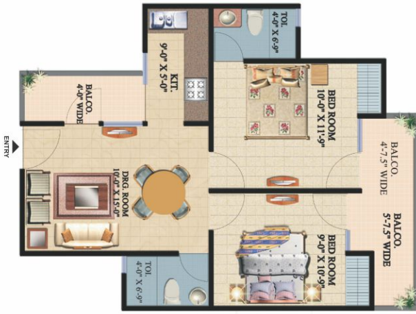
Super Area= 815 Sq. Ft. 2 Bed Rooms + 2 Toilets + Drawing / Dining + Kitchen + Balconies + Utility