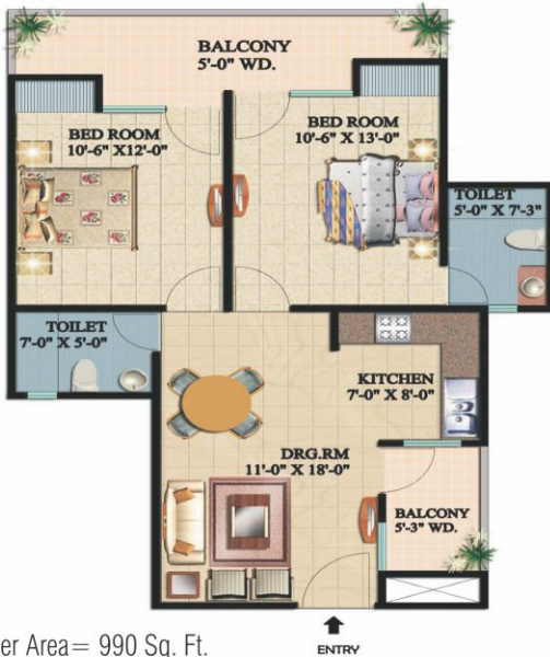
Super Area= 990 Sq. Ft. 2 Bedrooms + 2 Toilets + Drawing/Dining + Kitchen + Balconies + Utility