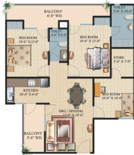
Super Area= 1370 Sq. Ft. (Tower H) 3 Bedrooms+2 Toilets+Drawing/Dining+Kitchen+Store+Balconies+Utility