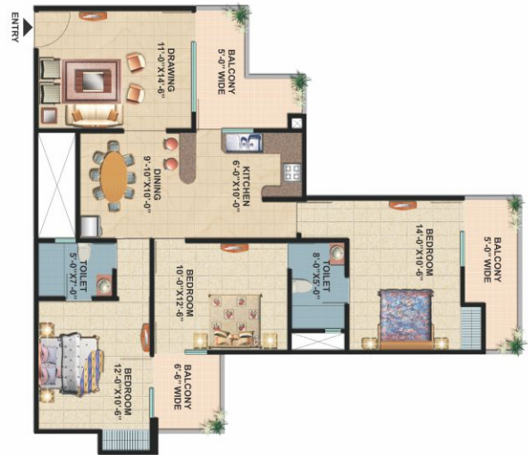
Super Area= 1490 Sq. Ft. 3 Bedrooms+2 Toilets+Drawing+Dining+Kitchen+ Balconies +Utility