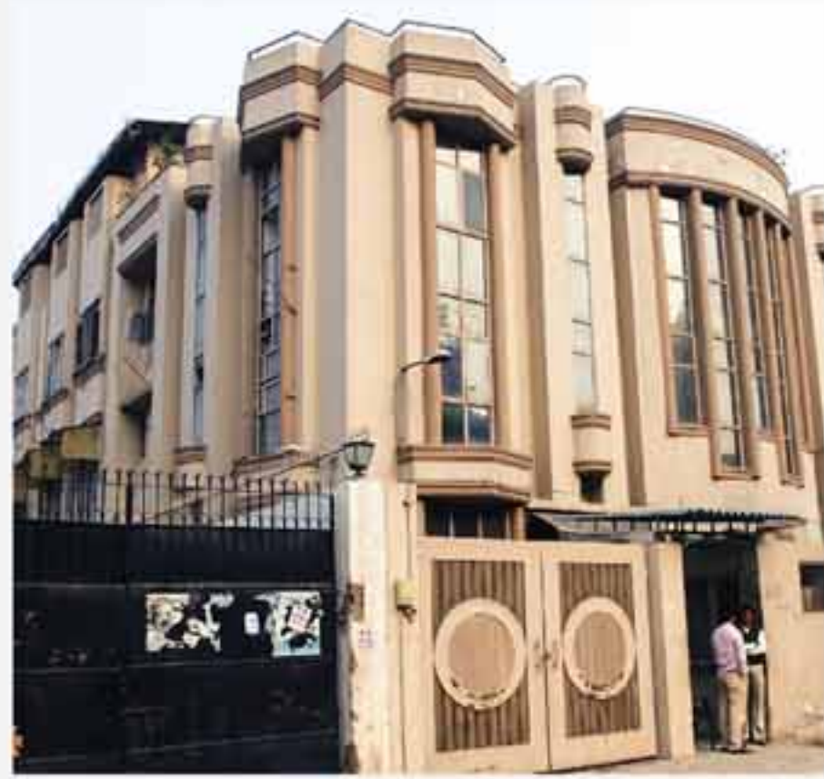
A-1/1, OKHLA PHASE-I