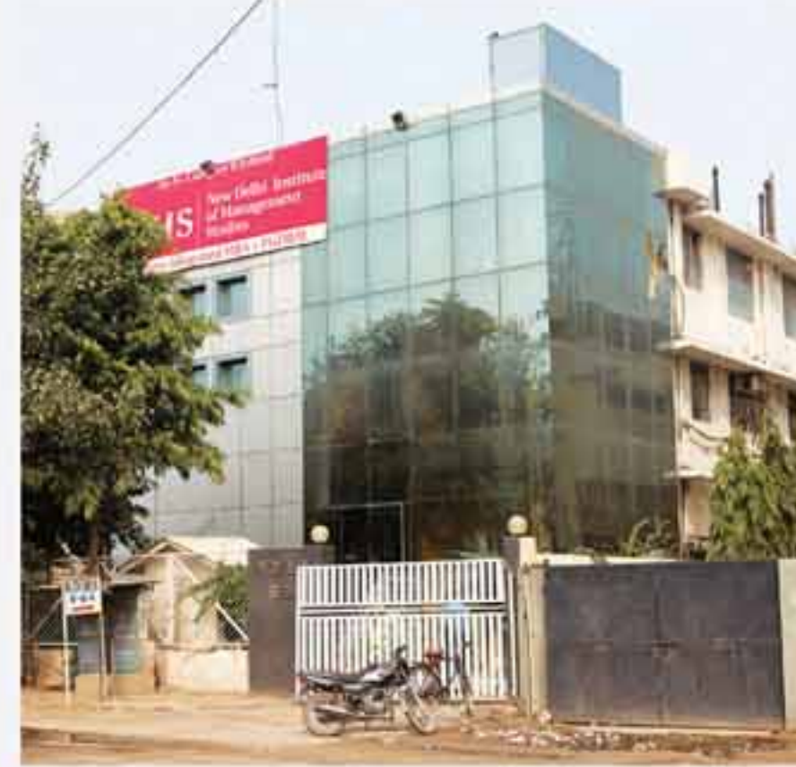
B-64, OKHLA PHASE-I