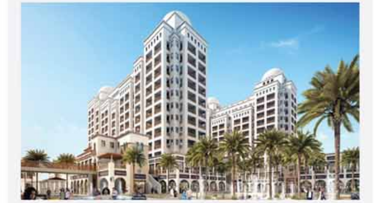
ELVEDOR Commercial Development at Sec 37 C, Gurgaon