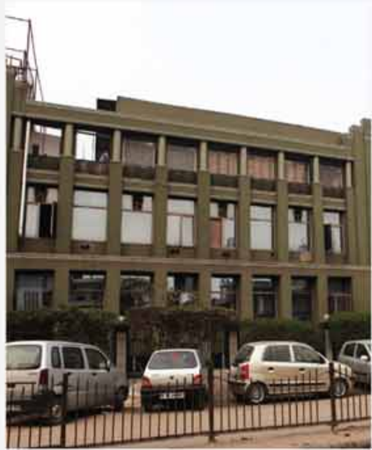
B-235, OKHLA PHASE-I