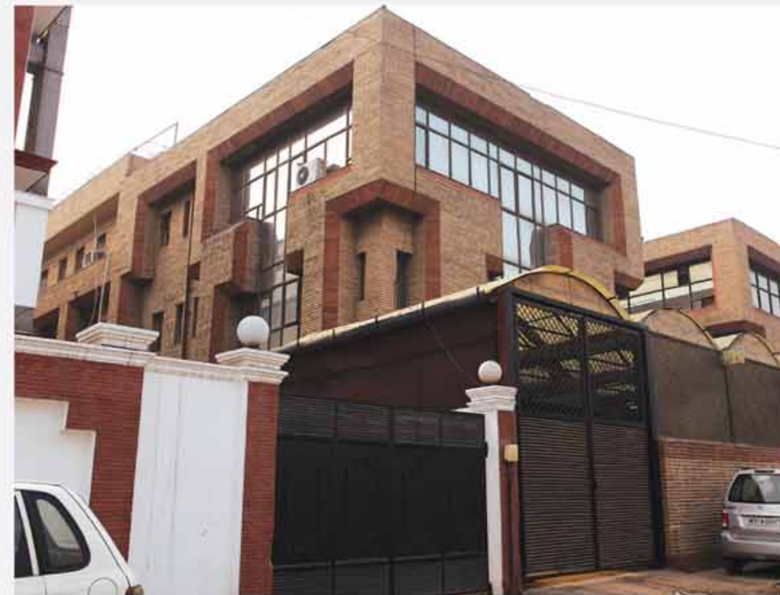
F-23/1, OKHLA PHASE-II