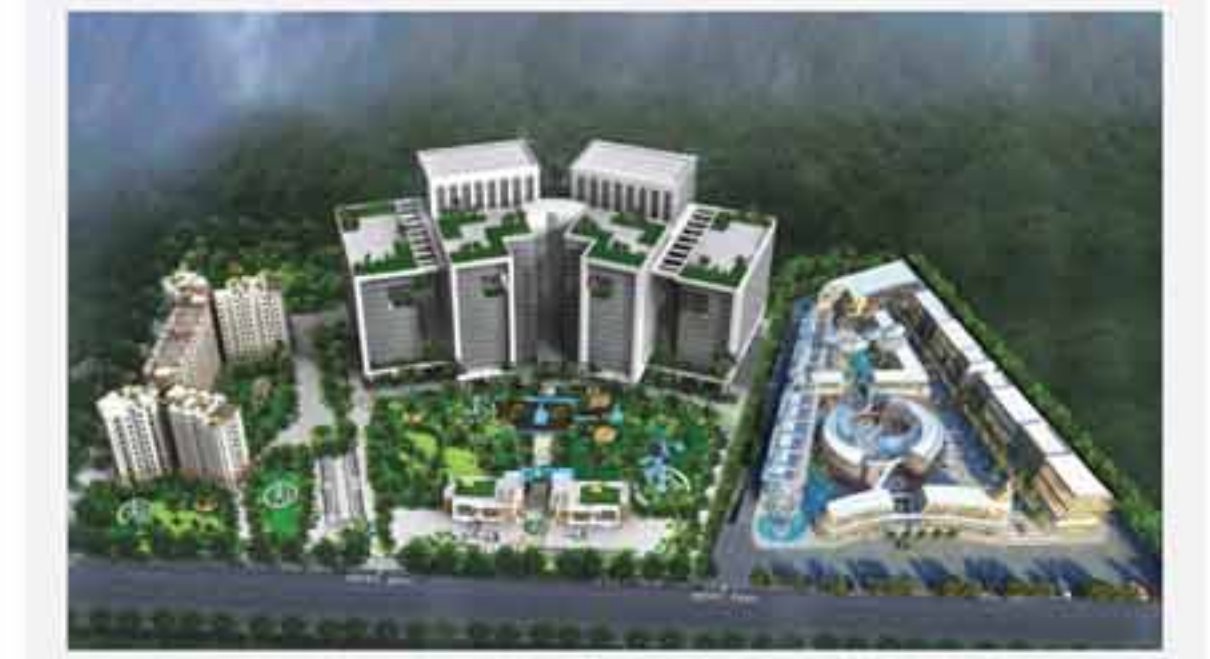
H2O Greater Noida West