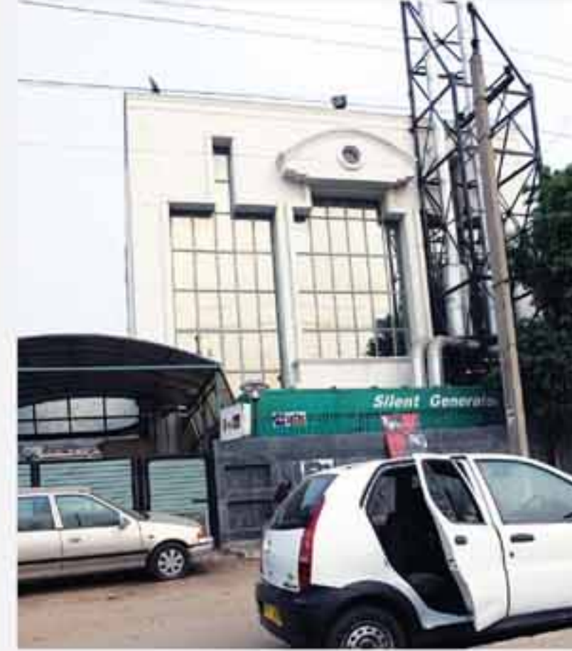
D-184, OKHLA PHASE-I