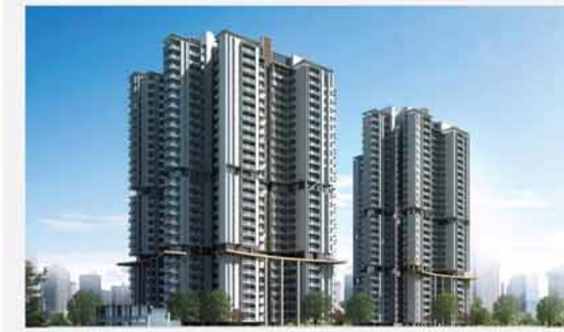
MIRAGE Homes at Sports City, Yamuna Expressway