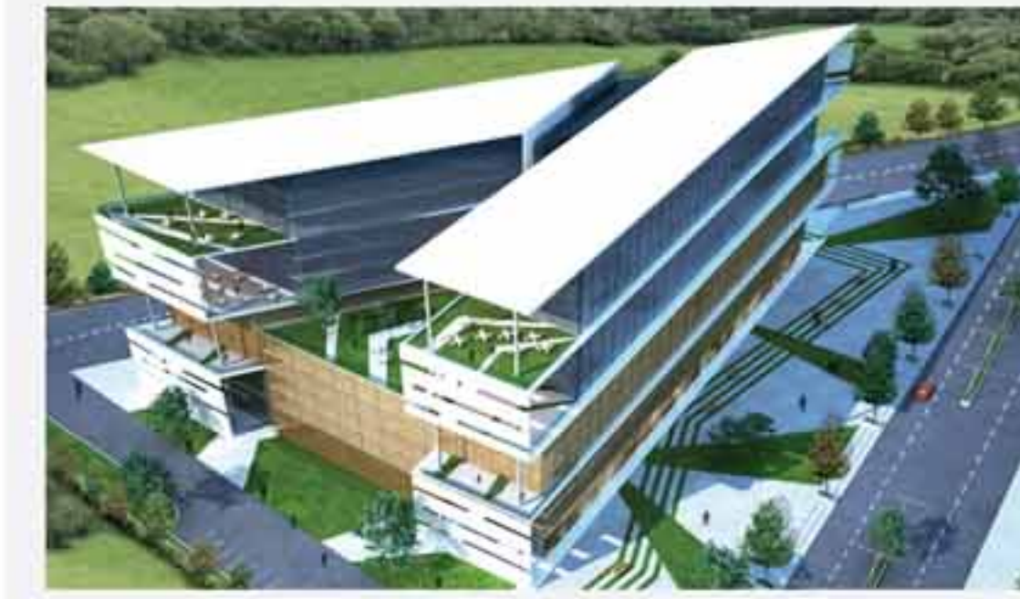
BYRON Sector 62, Golf Course Ext. Road, Gurgaon