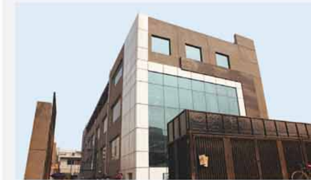
B-61, OKHLA PHASE-I