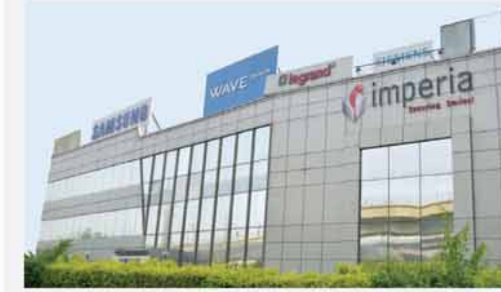
A-25, MATHURA ROAD