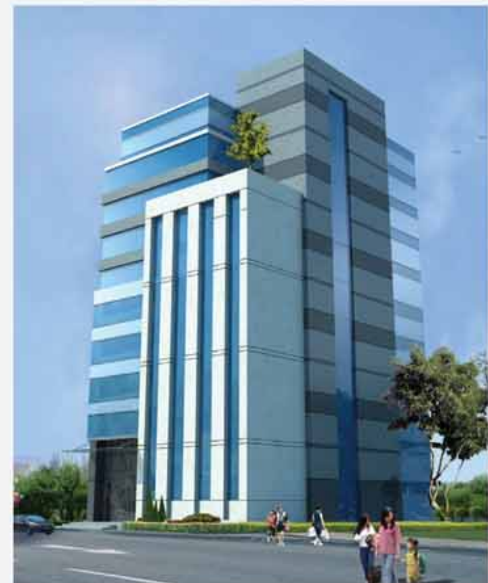
PLOT No. 7, SECTOR 125 NOIDA