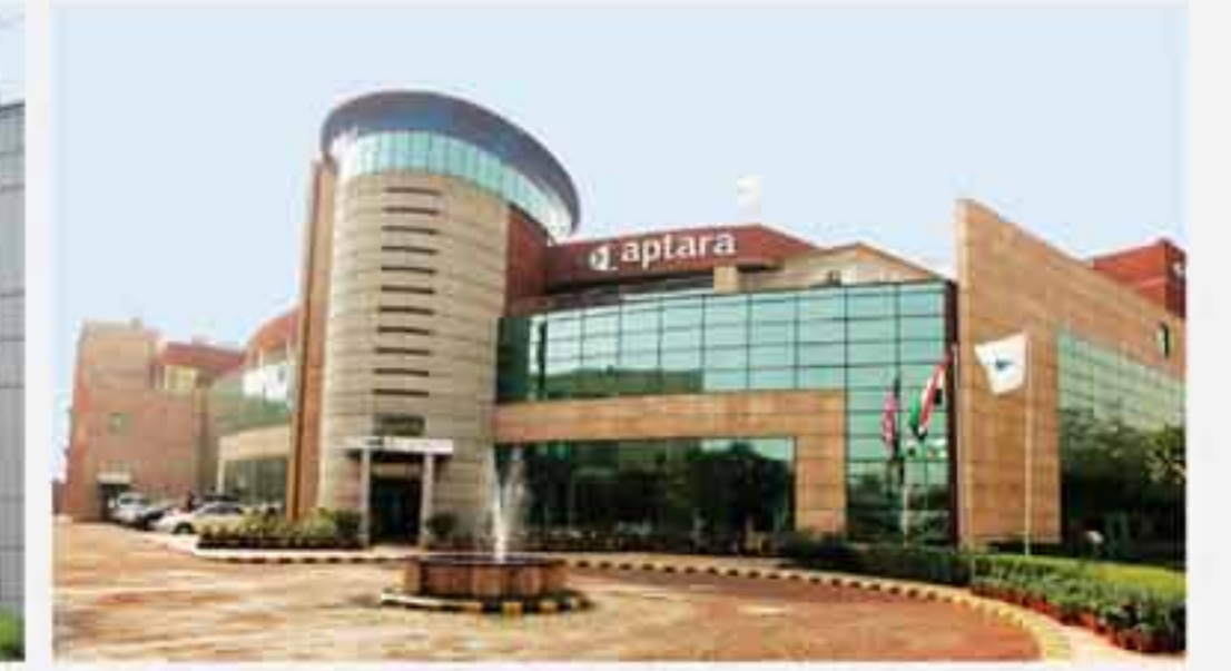
A-28, MATHURA ROAD