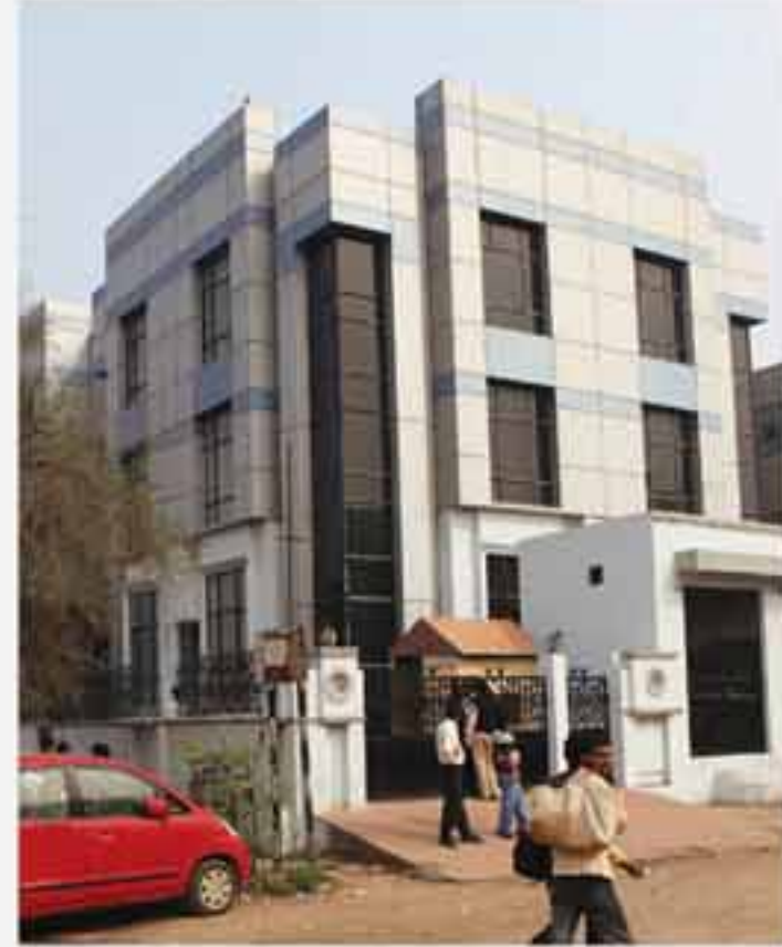
B-60, OKHLA PHASE-I