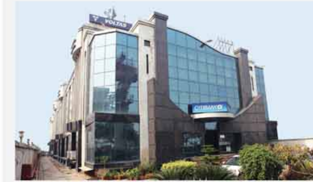
A-43, MATHURA ROAD