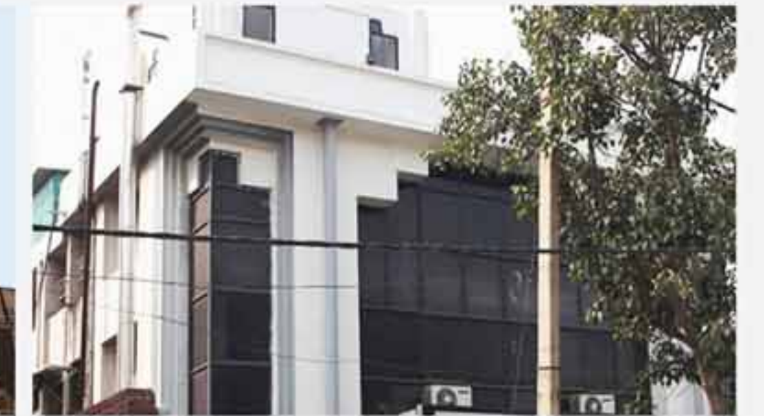
D-1/3, OKHLA PHASE-II