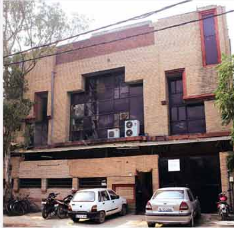
C-62/2, OKHLA PHASE-II