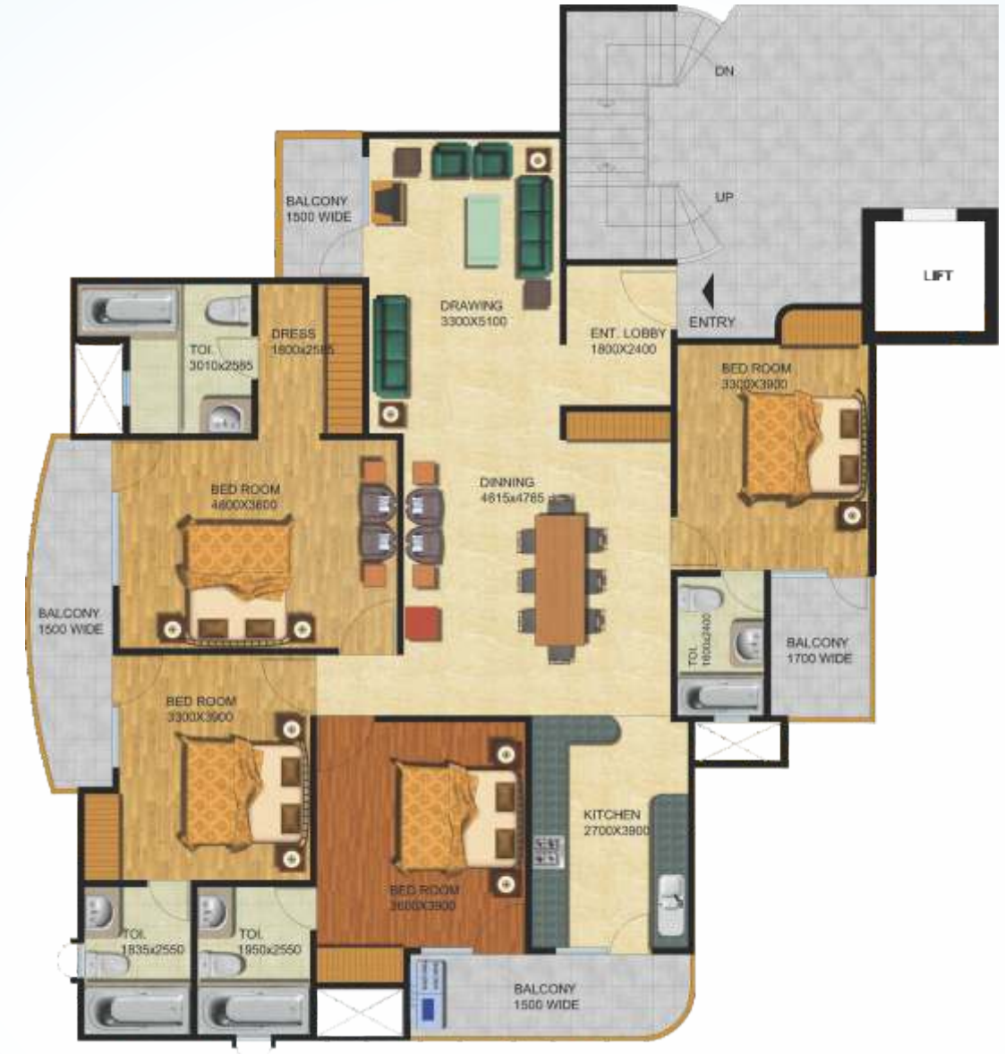
TYPICAL FLOOR PLAN 2535 Sq Ft