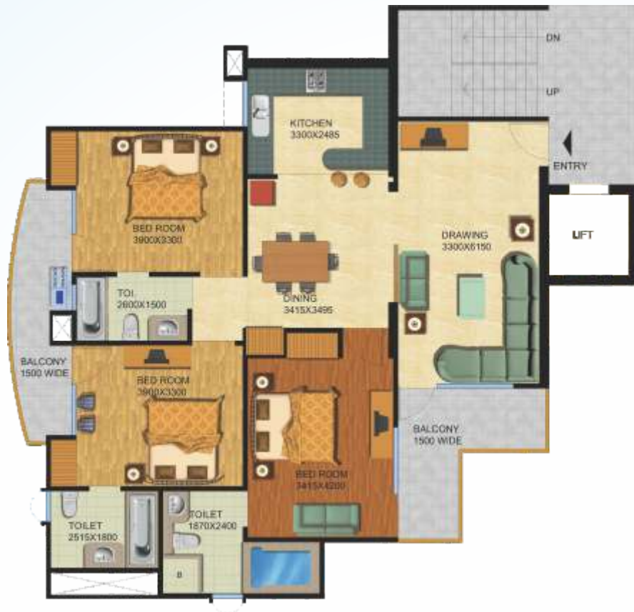
TYPICAL FLOOR PLAN 1750 sq. ft.