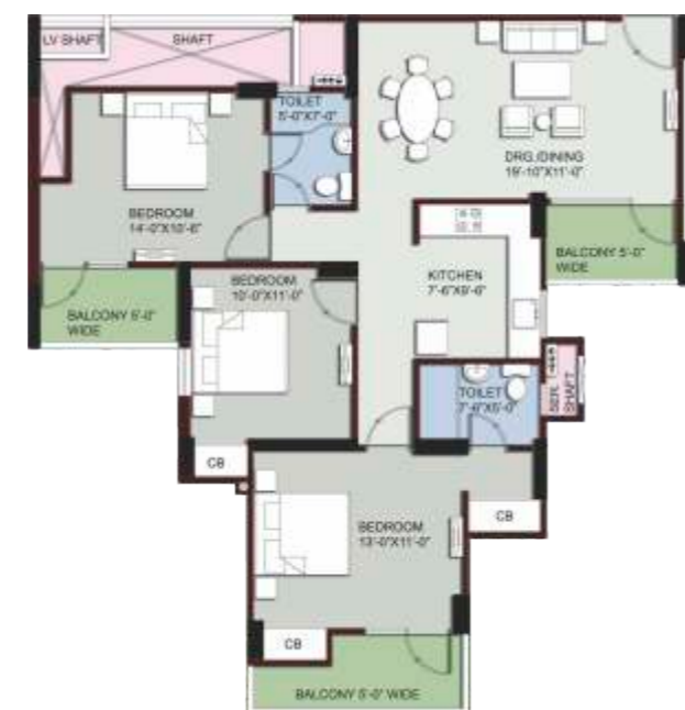
Area - 1459 Sq. Ft. • 3 Bedrooms • 2 Toilets • Kitchen • Dining • Drawing • 3 Balconies