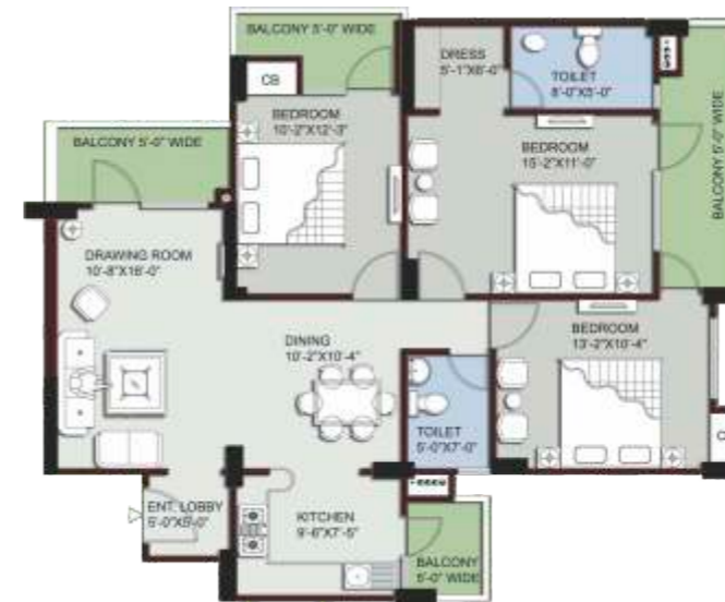
Area - 1585 Sq. Ft. • 3 Bedrooms • 2 Toilets • Kitchen • Dining • Drawing • 4 Balconies