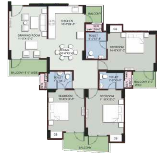
Area - 1649 Sq. Ft. • 3 Bedrooms • 3 Toilets • Kitchen • Dining • Drawing • 4 Balconies