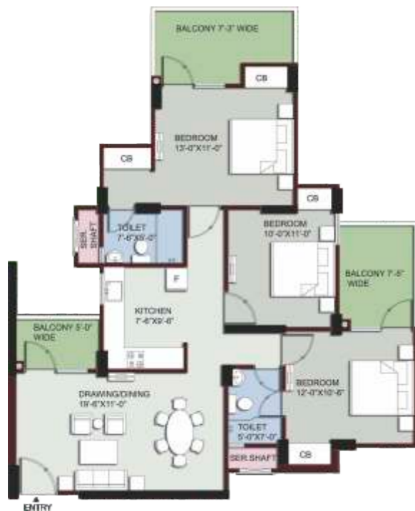
Area - 1420 Sq. Ft. • 3 Bedrooms • 2 Toilets • Kitchen • Dining • Drawing • 3 Balconies