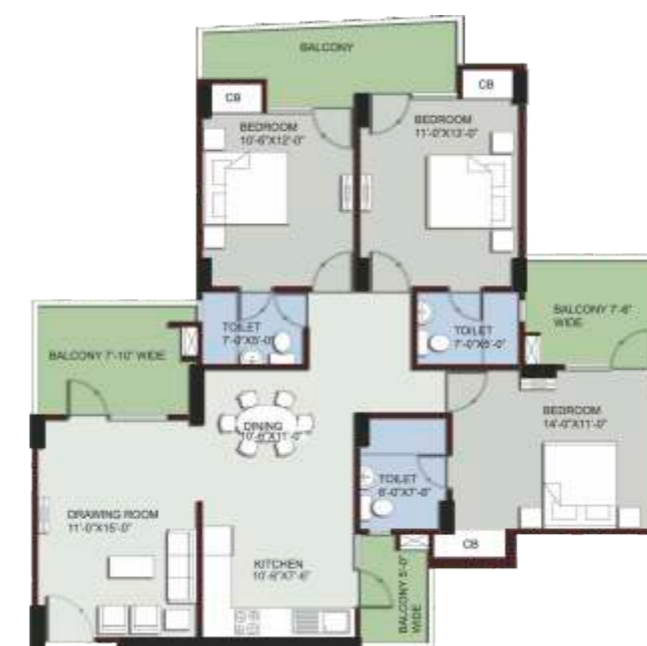
Area - 1680 Sq. Ft. • 3 Bedrooms • 3 Toilets • Kitchen • Dining • Drawing • 4 Balconies