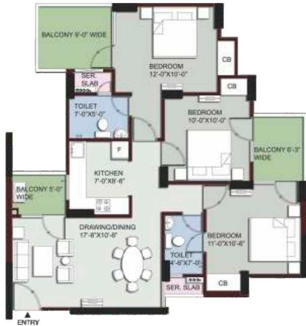
Area - 1230 Sq. Ft. • 3 Bedrooms • 2 Toilets • Kitchen • Dining • Drawing • 3 Balconies