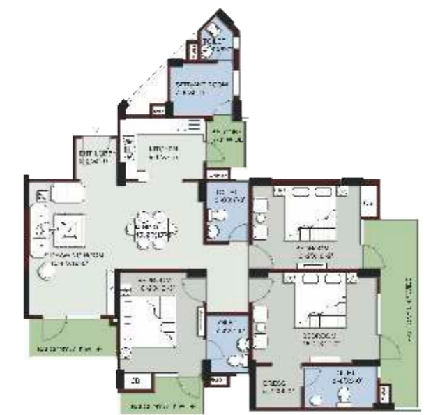
Area - 1850 Sq. Ft. • 3 Bedrooms • 4 Toilets • Kitchen • Dining • Drawing • 4 Balconies • Servant Room