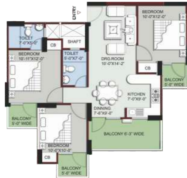
Area - 1275 Sq. Ft. • 3 Bedrooms • 2 Toilets • Kitchen • Dining • Drawing • 3 Balconies