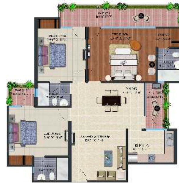
Area- 1660 Sq. Ft. 3 Bedroom, Dressing Room. 3 Toilet. Kitchen. Dining. Drawing. 3 Balconies.