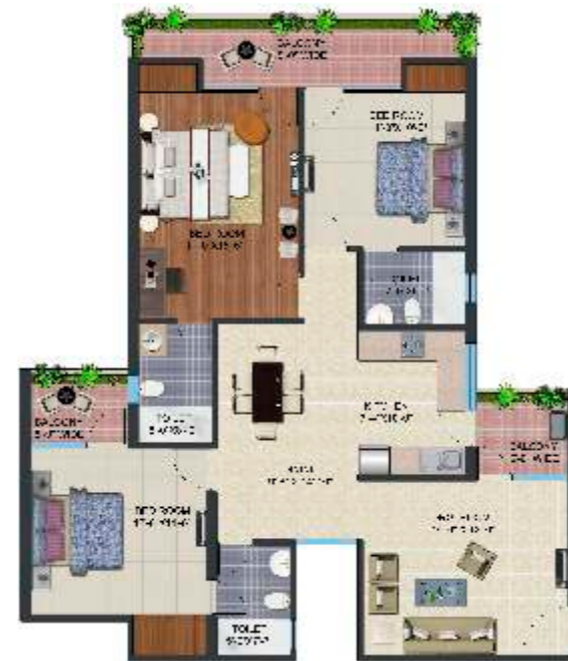
Area- 1660 Sq. Ft. 3 Bedroom, Dressing Room. 3 Toilet. Kitchen. Dining Drawing. 3 Balconies.