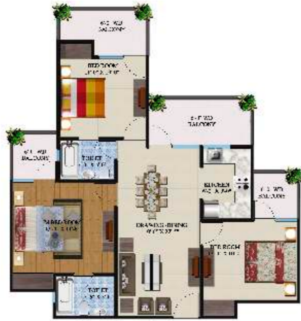
Area- 1375 Sq. Ft. 3 Bedroom. 2 Toilet. Kitchen. Dining. Drawing. 4 Balconies.