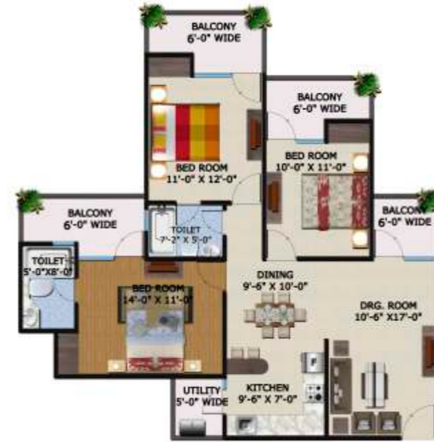
Area- 1545 Sq. Ft. 3 Bedroom. 2 Toilet. Kitchen. Dining. Drawing. 4 Balconies.