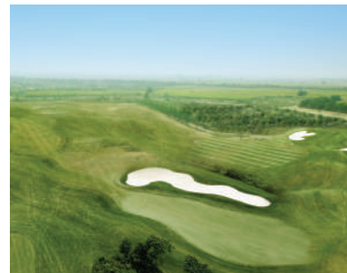
18 Hole Golf Course