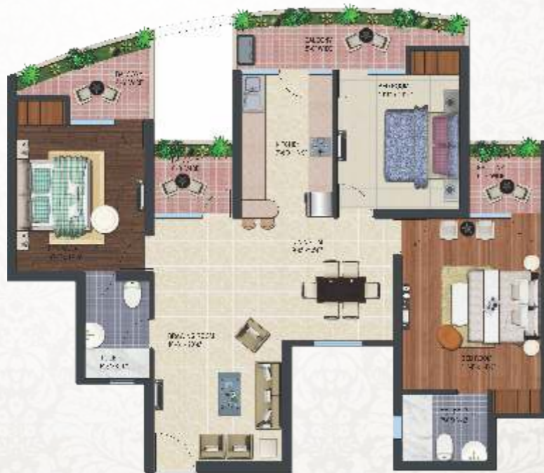
SUPER AREA - 1596 sq. ft. 3 Bedroom + 2 Toilets + Kitchen + Dining + Drawing + 4 Balcony