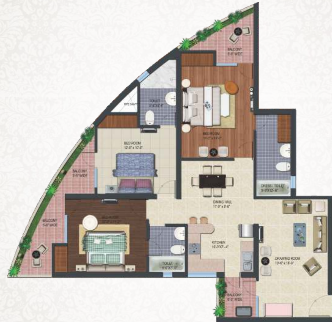
SUPER AREA - 1725 sq. ft. 3 Bedroom + 3 Toilets + Kitchen + Dining + Drawing + Dress + 4 Balcony