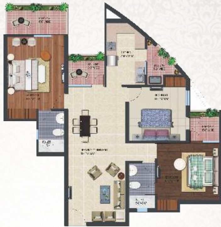
SUPER AREA - 1590 sq. ft. 3 Bedroom + 2 Toilets + Kitchen + Dining + Drawing + 4 Balcony