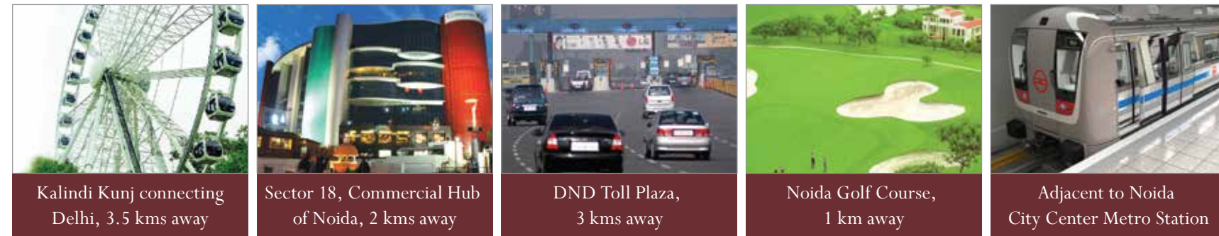
Kalindi Kunj connecting Delhi, 3.5 kms away