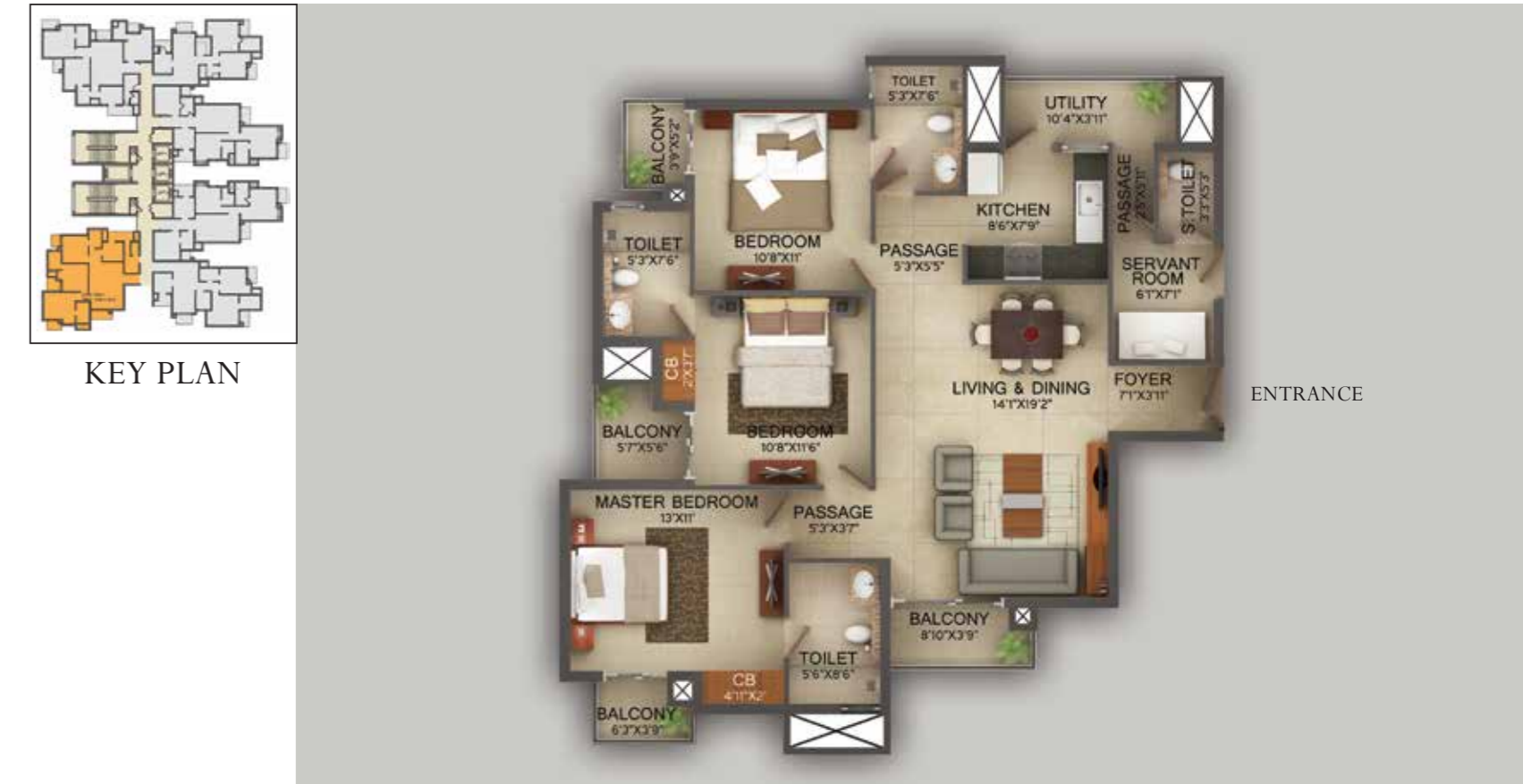
Type 2 - 3 Bedroom + Servant Room + Living & Dining + Kitchen + 3 Toilets Saleable Area 1748.12 sq. ft. | Built-up Area 1349.29 sq. ft.