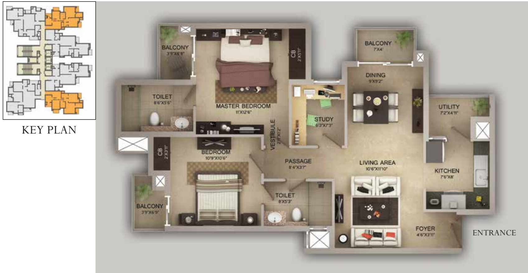
2 Bedroom + Study + Living & Dining + Kitchen + 2 Toilets Saleable Area 1264.18 sq. ft. | Built-up Area 974.56 sq. ft.