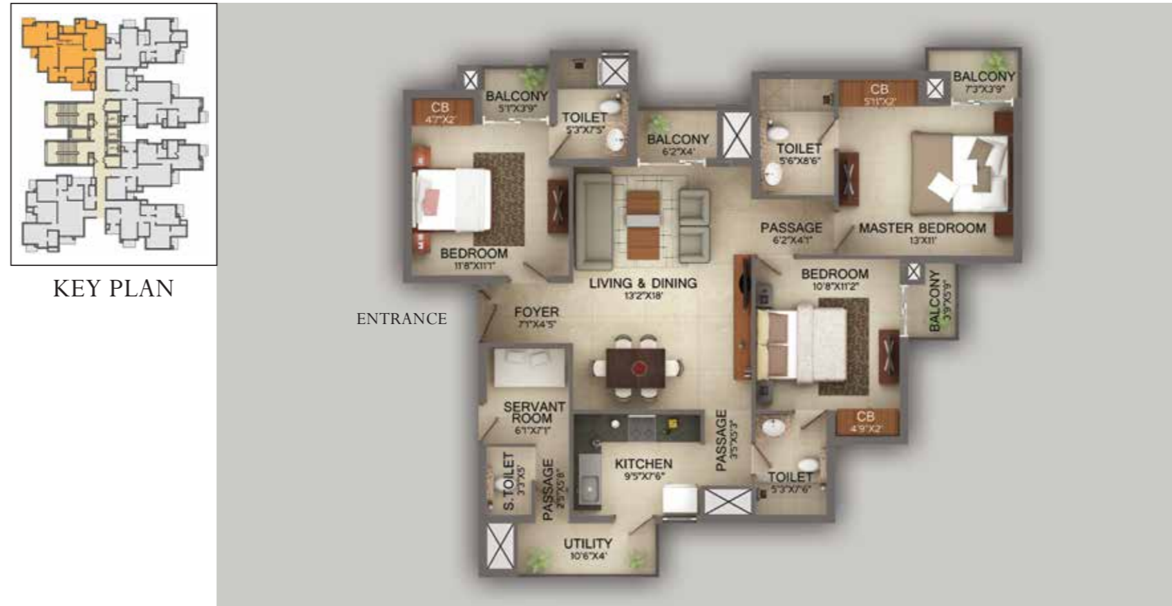
Type 1 - 3 Bedroom + Servant Room + Living & Dining + Kitchen + 3 Toilets Saleable Area 1714.84 sq. ft. | Built-up Area 1318.27 sq. ft.