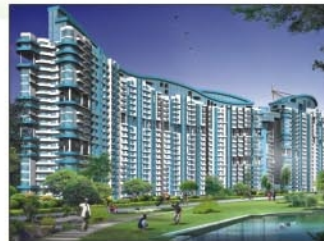
Amrapali Platinum, Noida