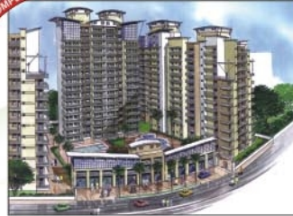
Amrapali Green, Indirapuram