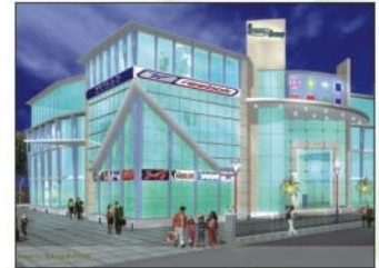
Amrapali Mall, Bareilly