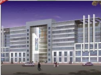
Amrapali IMT Manesar, Gurgaon