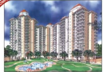
Amrapali Royal, Indirapuram