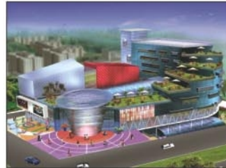
Amrapali Mall, Vrindavan