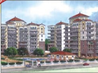
Amrapali Exotica, Noida