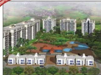
Amrapali Grand, Greater Noida