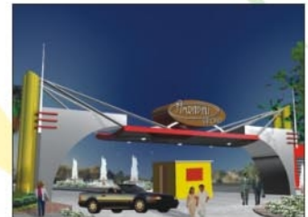
Amrapali Modern City, Indore