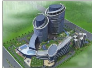
Amrapali Tech-Park, Greater Noida