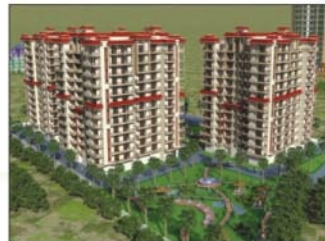
Nirala Eden Park II, Indirapuram