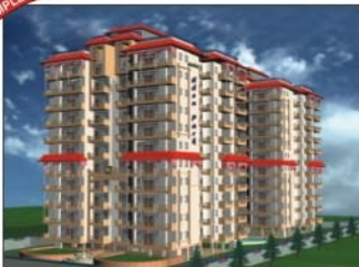
Nirala Eden Park I, Indirapuram