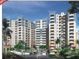
Amrapali Village, Indirapuram