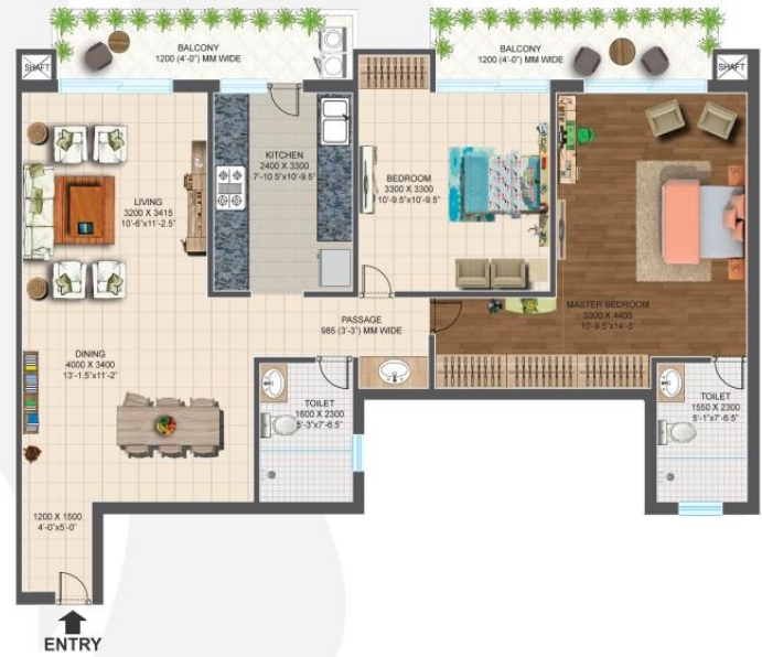
Type-D Center (2BHK) Super Area: 1360 Sq. Ft.