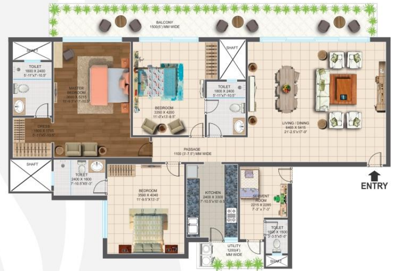
Type-B (3BHK + Servant) Super Area: 2190 Sq. Ft.