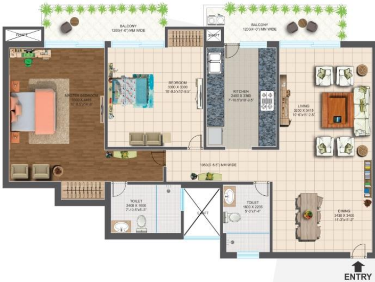
Type-D (2BHK) Super Area: 1310 Sq. Ft.