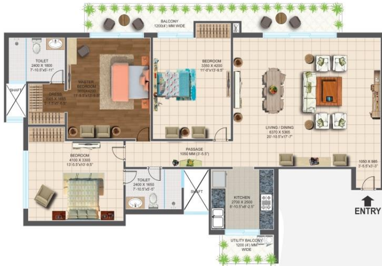
Type-C (3BHK) Super Area: 1750 Sq. Ft.