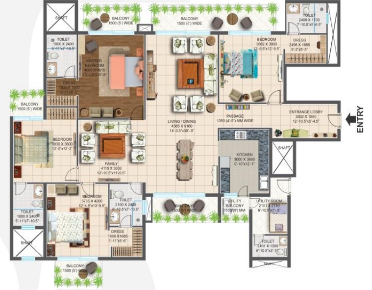
Type-A1 (4BHK + Servant) Super Area: 3220 Sq. Ft.