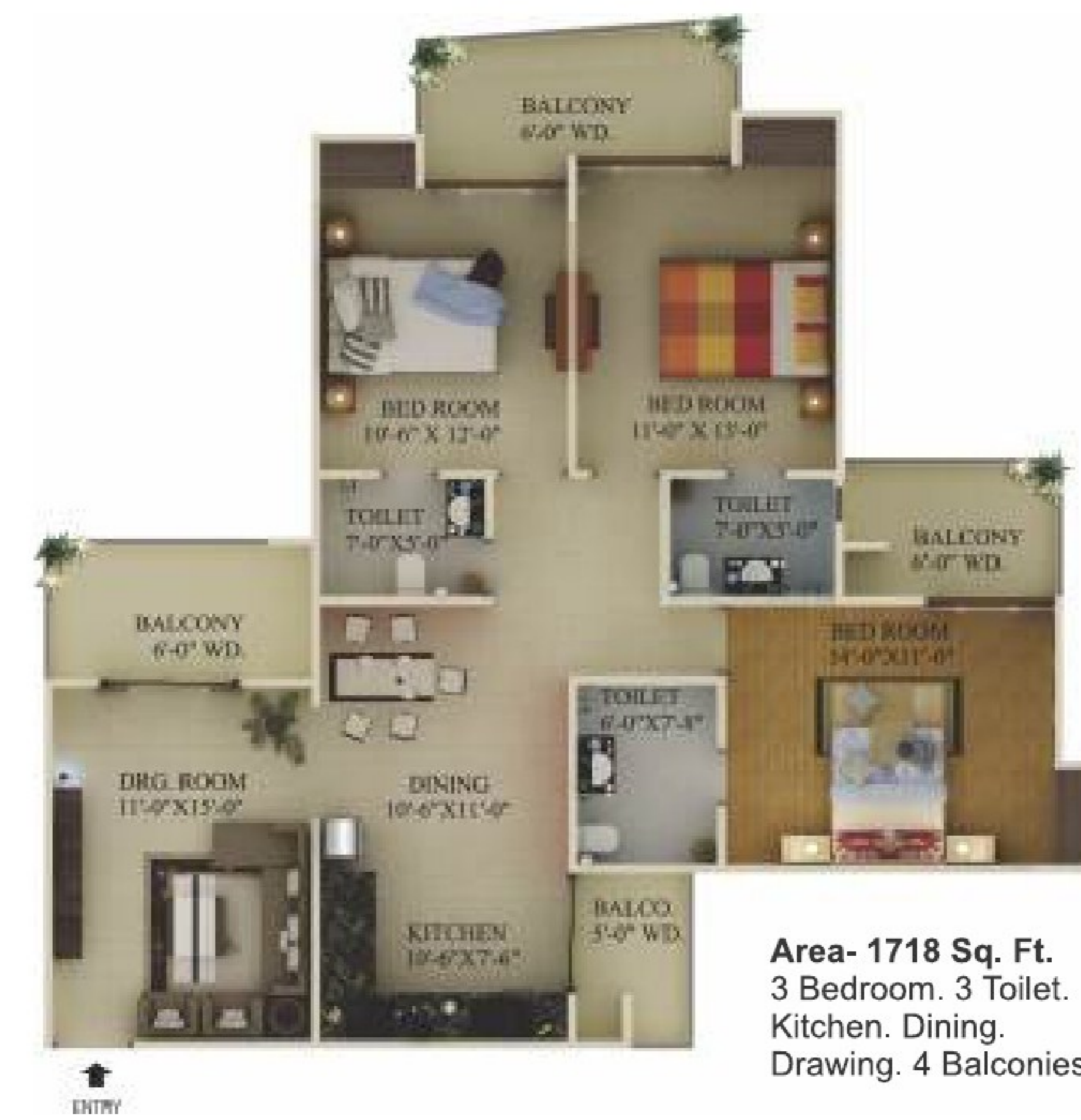
Area- 1718 Sq. Ft. 3 Bedroom, 3 Toilet, Kitchen, Dining, Drawing, 4 Balconies.