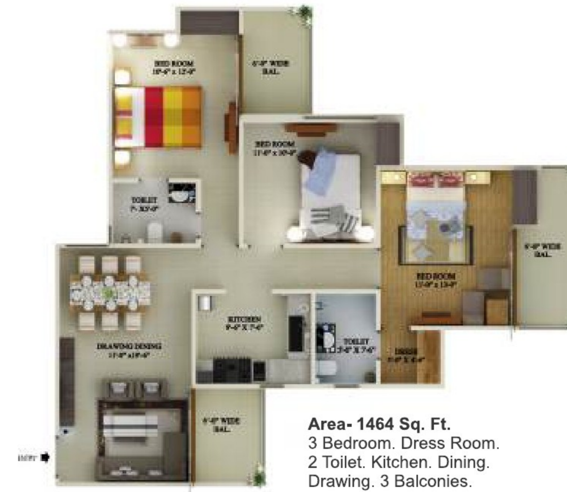
Area- 1464 Sq. Ft. 3 Bedroom, Dress Room, 2 Toilet, Kitchen, Dining, Drawing, 3 Balconies.