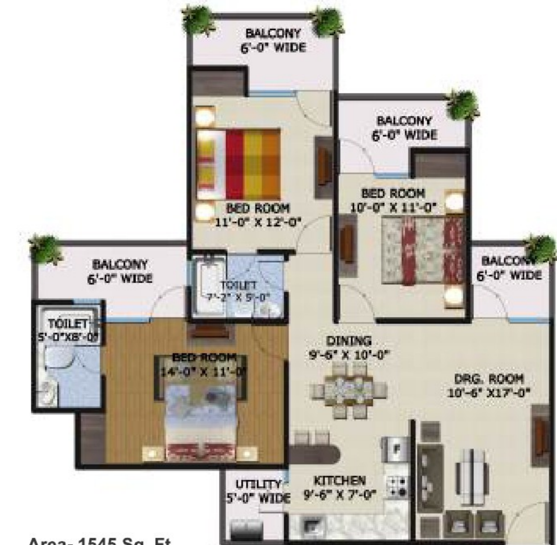
Area- 1545 Sq. Ft. 3 Bedroom, 2 Toilet, Kitchen, Dining, Drawing, 4 Balconies, Servant Room