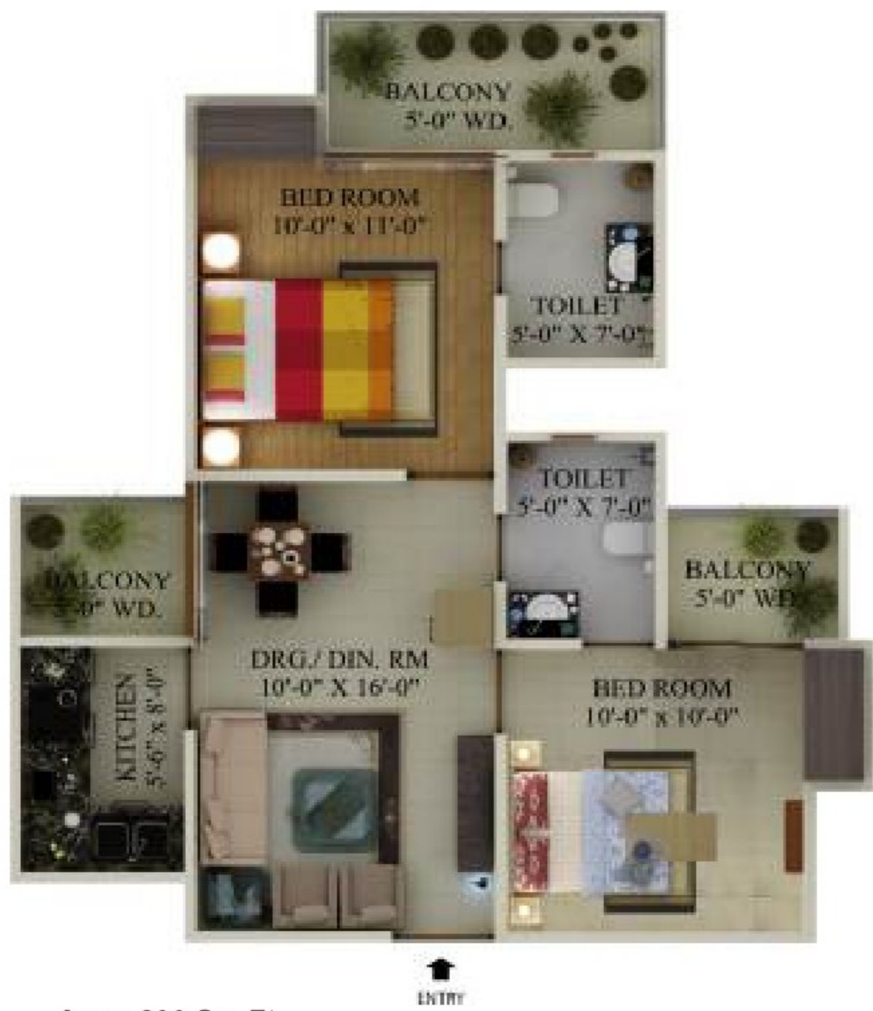
Area- 890 Sq. Ft. 2 Bedroom, 2 Toilet, Kitchen, Dining, Drawing, 3 Balconies.