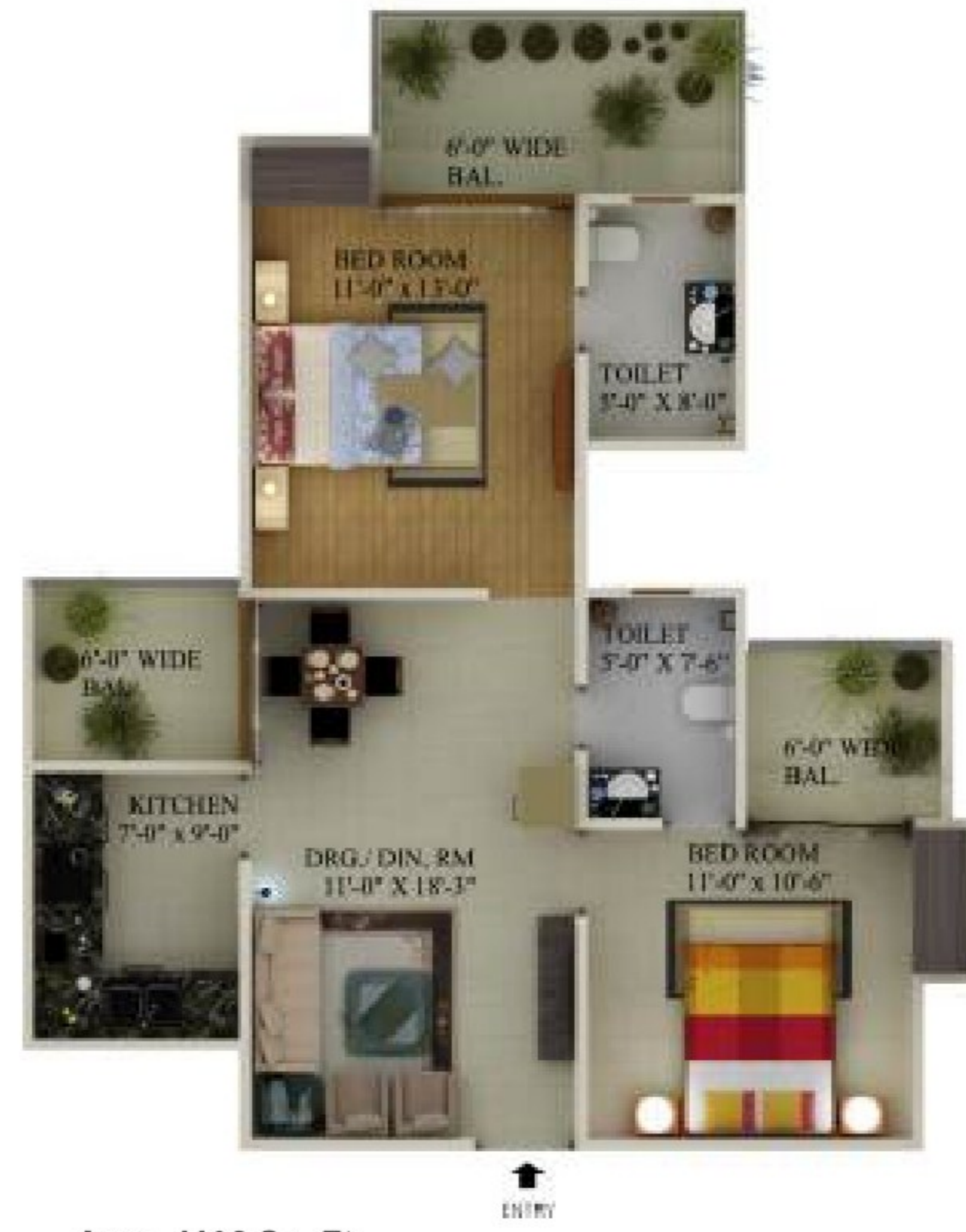
Area- 1106 Sq. Ft. 2 Bedroom, 2 Toilet, Kitchen, Dining, Drawing, 3 Balconies.