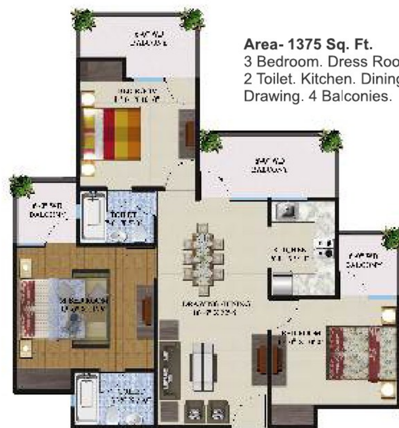
Area- 1375 Sq. Ft. 3 Bedroom, Dress Room, 2 Toilet, Kitchen, Dining, Drawing, 4 Balconies.