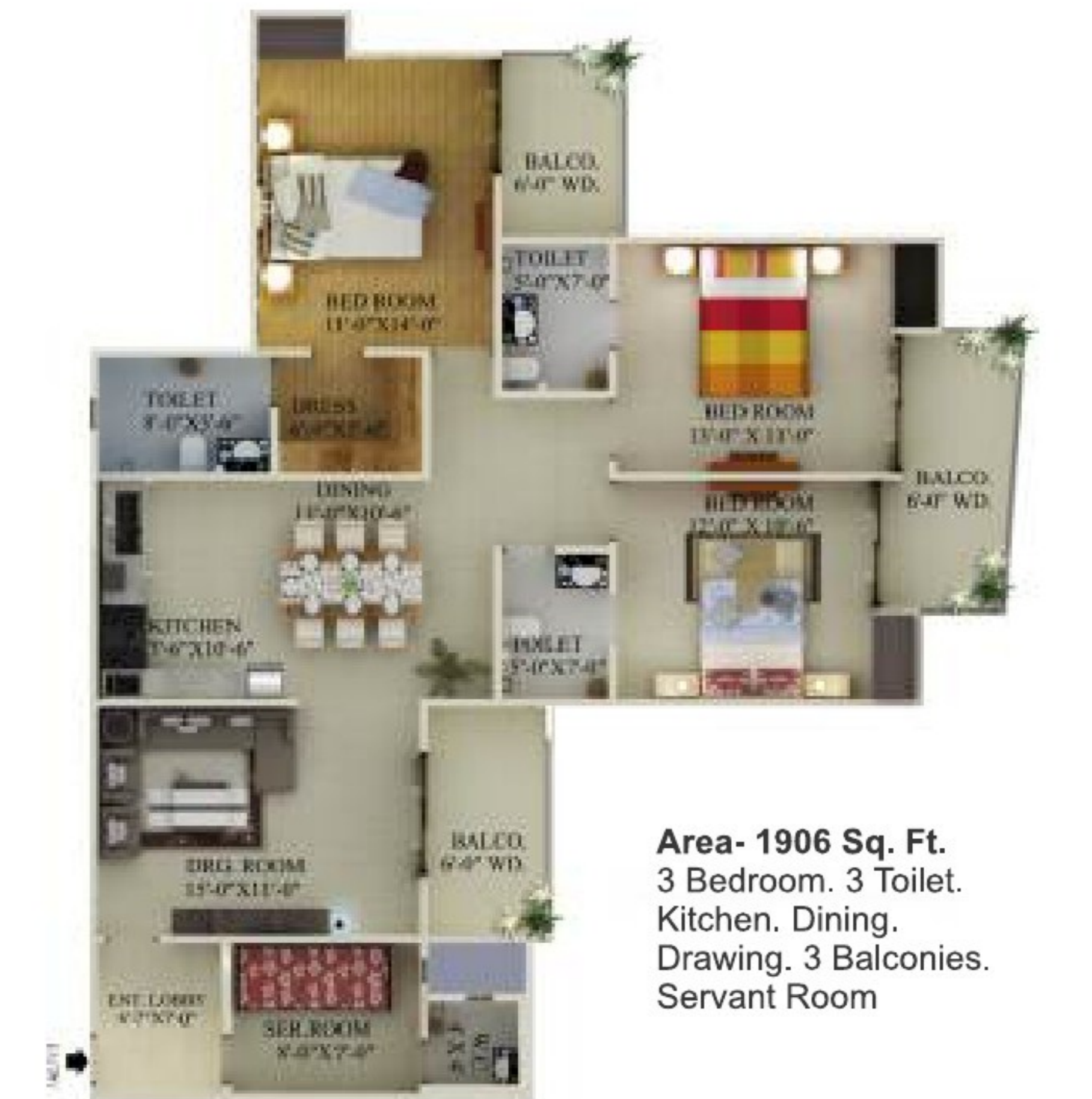
Area- 1906 Sq. Ft. 3 Bedroom, 3 Toilet, Kitchen, Dining, Drawing, 3 Balconies, Servant Room