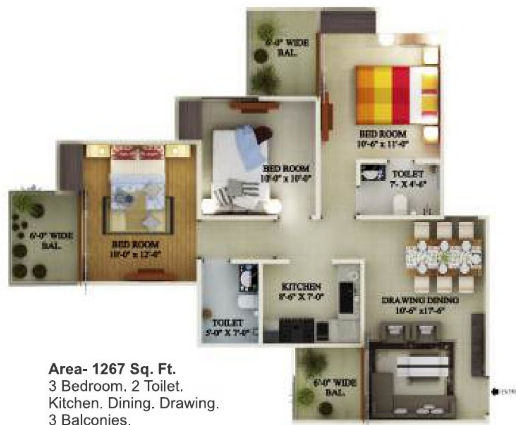
Area- 1267 Sq. Ft. 3 Bedroom, 2 Toilet, Kitchen, Dining, Drawing, 3 Balconies.